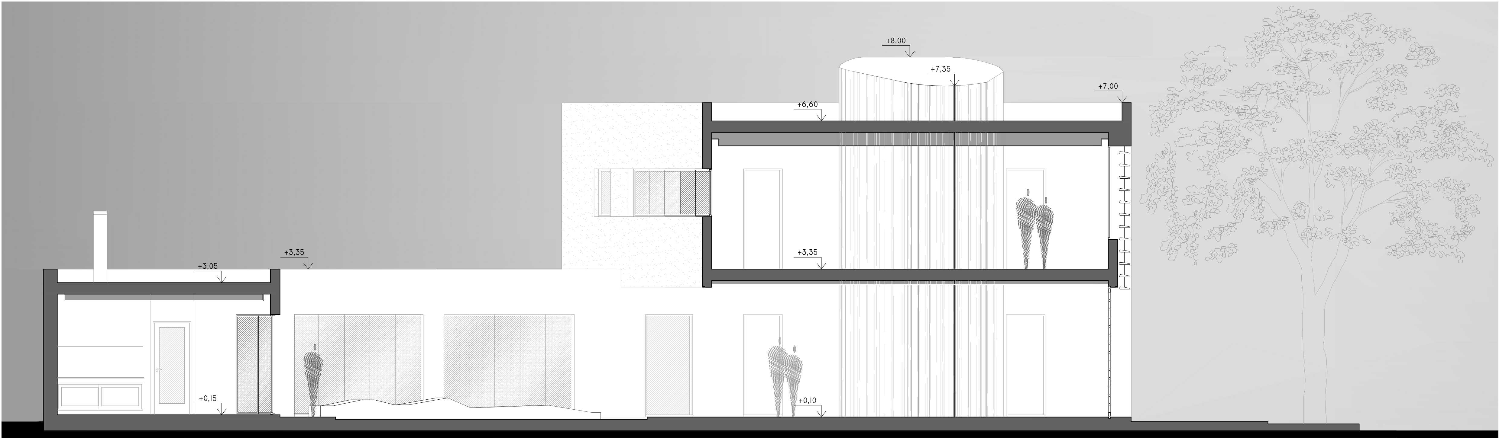
CORTE LONGITUDINAL ESC: 1/50