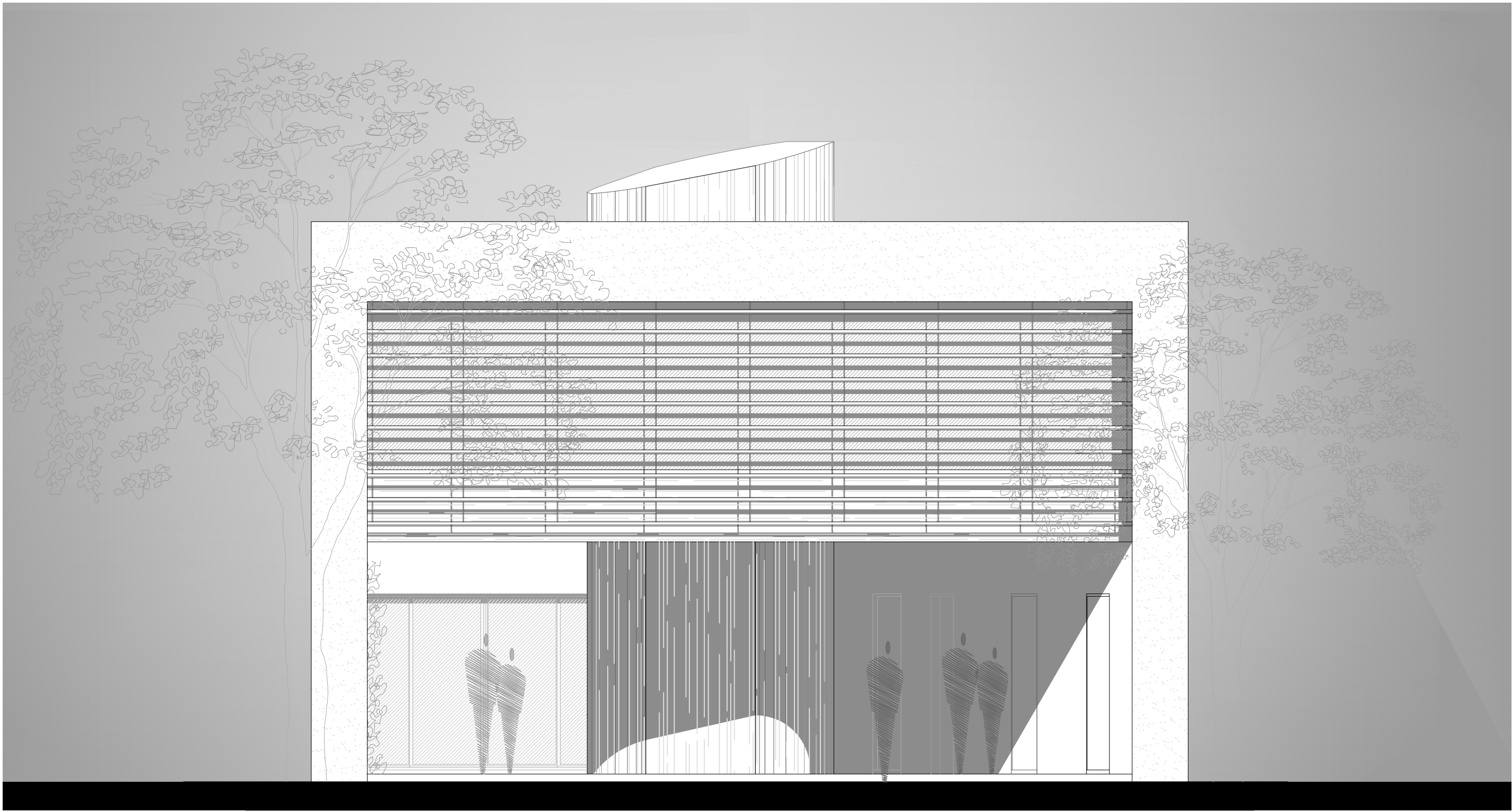
FACHADA ESC: 1/50